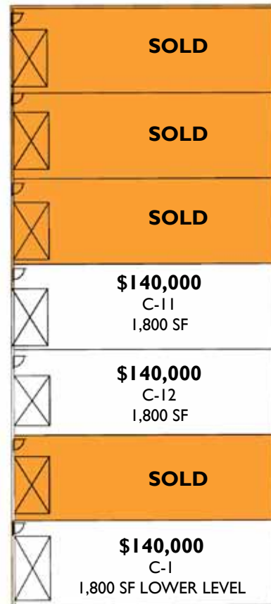
BUILDING C—Second floor